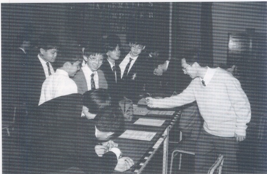
"Twelve seconds left!"